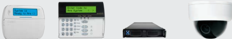
DSC PowerSeries Neo and MAXSYS Alarm Panels